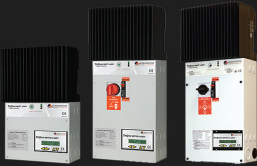
Standard, DB, and TR versions shown with optional display meters