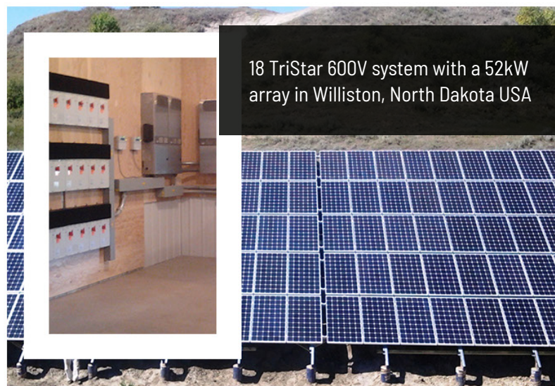
18 TriStar 600V system with a 52kW array in Williston, North Dakota USA