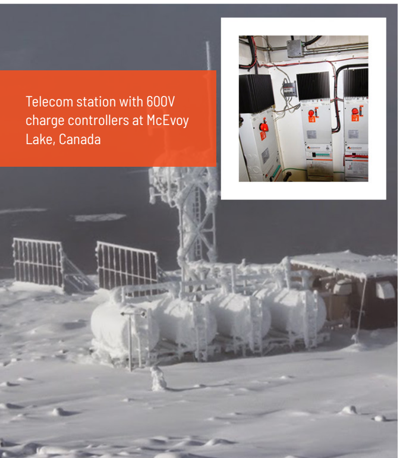
Telecom station with 600V charge controllers at McEvoy Lake, Canada