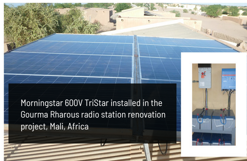
Morningstar 600V TriStar installed in the Gourma Rharous radio station renovation project, Mali, Africa